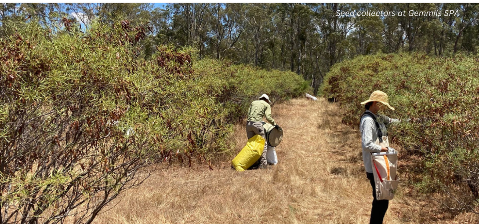
Seed collectors at Gemmils SPA